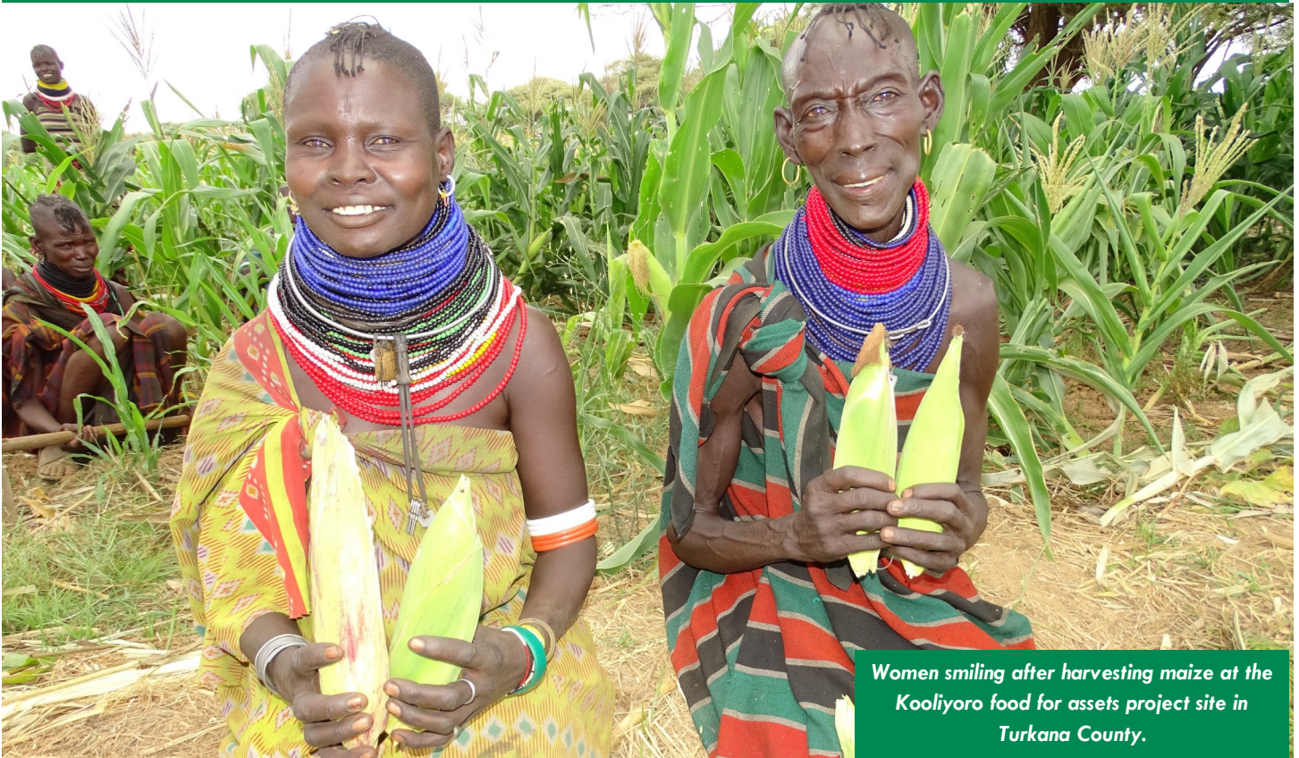
Women smiling after harvesting maize at the Kooliyo food for assets project site in Turkana County.

ChildFund International is a non-governmental organization that works throughout Asia, Africa and the Americas to connect children with the people, resources and institutions they need to grow up safe, healthy, educated and skilled, wherever they are. Delivered through over 250 local implementing partner organizations, our programs address the underlying conditions that prevent any child or youth from achieving their full potential. We place a special emphasis on child protection throughout our approach because violence, exploitation, abuse and neglect can reverse developmental gains in an instant. Last year, we reached 13.6 million children and family members in 24 countries.